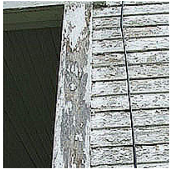
Paint Peeling on a House

lead based paint are at risk from inhalation of lead dust or fumes.